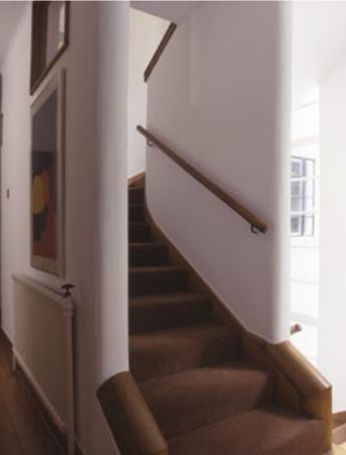
Facing page: Front entrance Above, clockwise from top: Bedroom 2, landing with original staircase, dining room