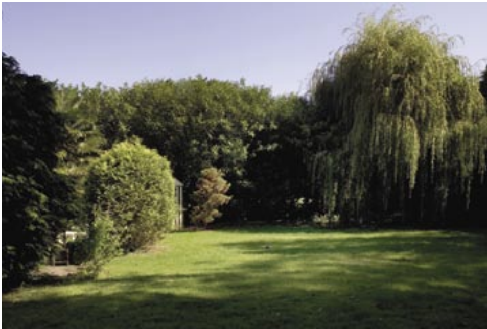
Clockwise from top: Swimming pool, rear garden, view of the house and pool from rear garden

Please note that all areas, measurements and distances given in these sales particulars are approximate and rounded. The text, photographs and floor plans are for general guidance only. The Modern House has not tested any services, appliances or specific fittings – prospective purchasers are advised to inspect the property themselves. All fixtures, fittings and furniture not specifically itemised within these particulars are deemed removable by the vendor.