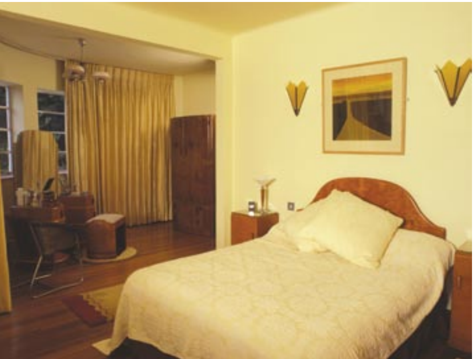
Facing page, clockwise from top left: Living room, living room, kitchen, living room This page: Bathroom, master bedroom